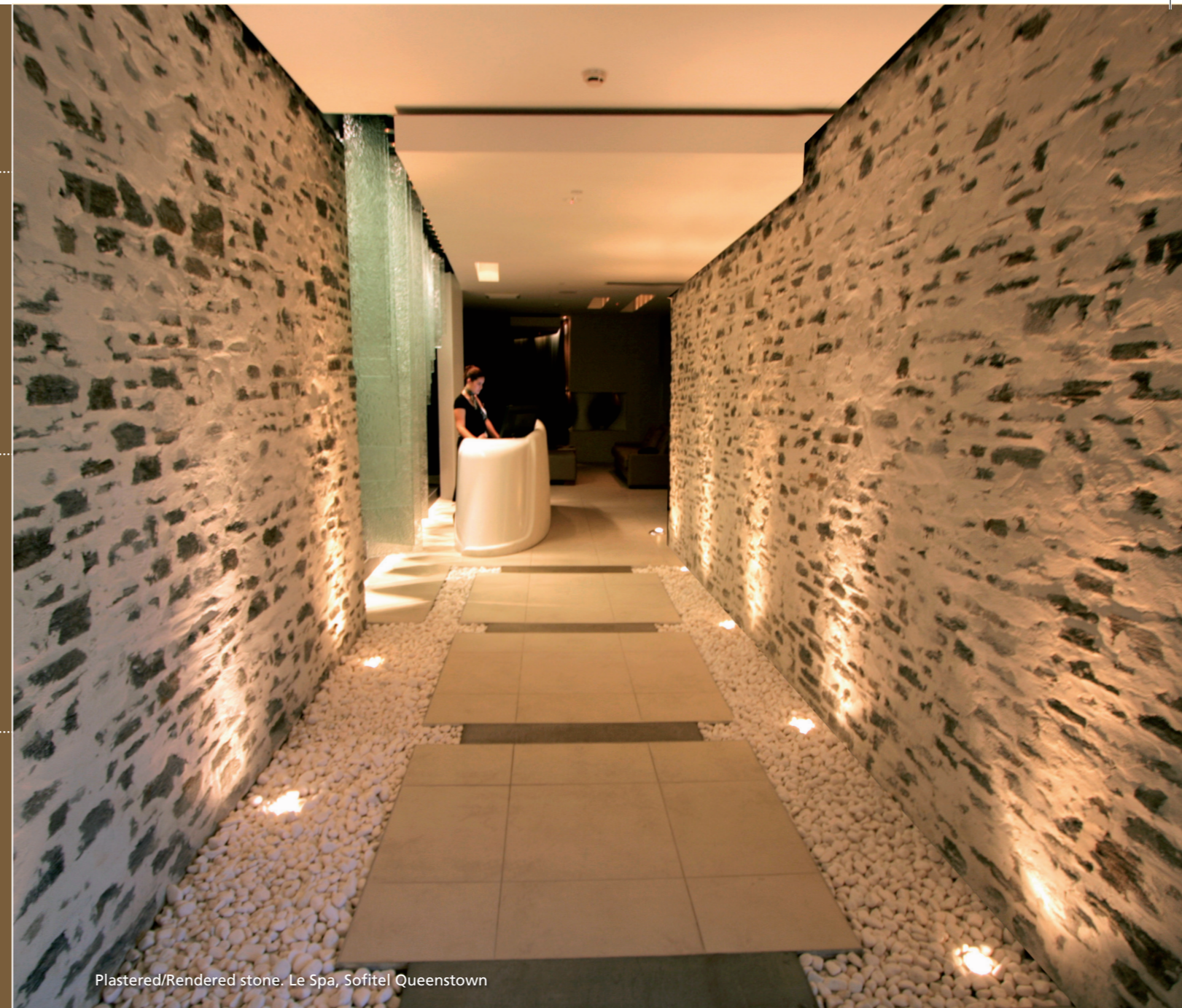
Plastered/Rendered stone. Le Spa, Sofitel Queenstown

Stone Heritage can source, supply and lay a variety of natural stone tiles. Enquire for more details.