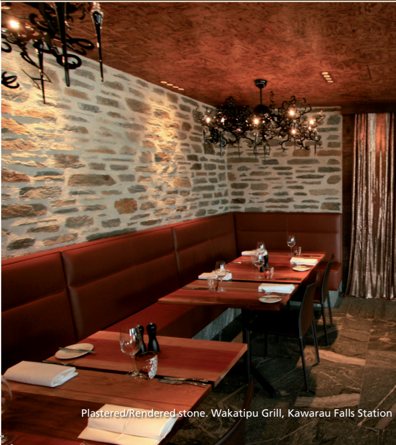
Plastered/Rendered stone. Wakatipu Grill, Kawarau Falls Station