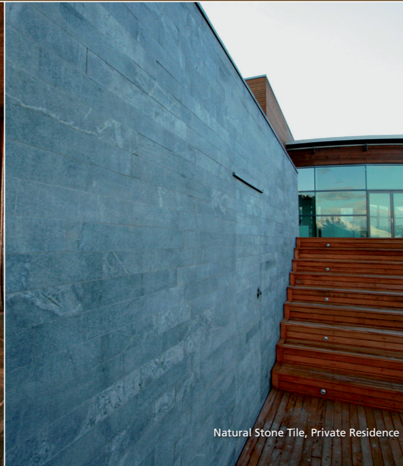
Natural Stone Tile, Private Residence

The team at Stone Heritage share and maintain a common goal striving to supply an exceptional level of stone masonry.